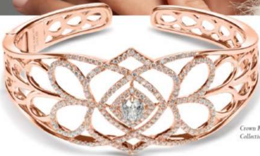
Crown Regal Collection