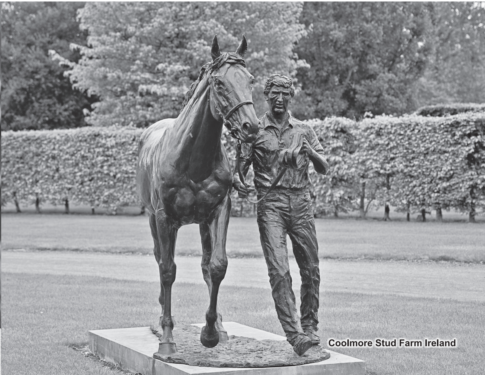
Coolmore Stud Farm Ireland

at the Historic Garrison Savannah World Heritage Site, St Michael, Barbados