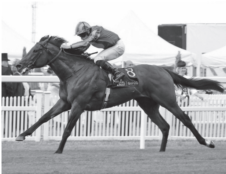
PADDINGTON (Bay 2020 16.1 hh (1.65 m)) Siyouni - Modern Eagle (Monjeu)

The only unbeaten Triple Crown winner, ever! The best son of the sensational stallion and sire of sires SCAT DADDY 6 wins by nearly 24 lengths and nearly $3.8m from 7-12f., from fast to sloppy tracks. 5 triple digit Beyer Speed Figures in 2018.