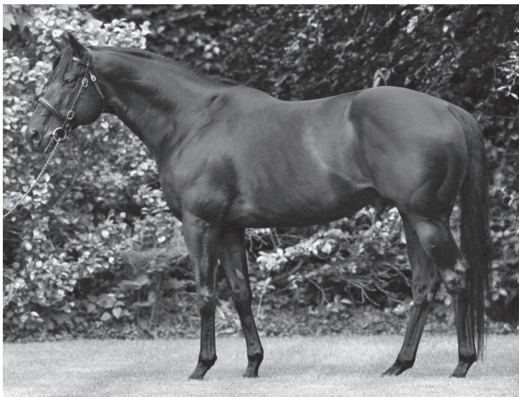
WOOTTON BASSETT (Bay 2008 16.0½ hh (1.63 m)) Iffraaj - Balladonia (Primo Domine)

[WON] Irish 2,000 Guineas-Gr.1, Curragh, 1m, St. James's Palace Stakes-Gr.1, Royal Ascot, 1m, by 3¾, lengths from Dewhurst Stakes-Gr.1 and 2,000 Guineas-Gr.1 winner Chaldean, Eclipse Stakes-Gr.1, Sandown, 1m2f. "A really lovely horse – and proper stallion prospect" John Gosden, trainer of the runner-up Emily Upjohn