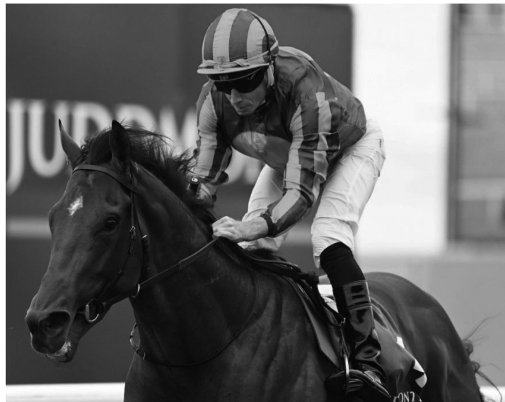
HENRY LONGFELLOW (Bay 2021 15.3 hh (1.60m) Dubawi - Minding (Galileo)

Brilliantly fast Grade 1 winner by hot young sire PRACTICAL JOKE Precocious winner of the Gr.3 Tampa Bay Derby & emphatic winner of the Gr.3 Dwyer Stakes "He launched while three deep entering the far turn, hit the front as they straightened for home and blasted off to score by 7 ½ length." TDN, 7/6/24 Emulated his sire by winning the Gr.1 H. Allen Jerkens Memorial Stakes, defeating three Gr.1 winners in doing so! "Like Father, Like Son.