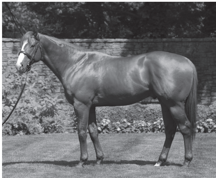
JUSTIFY (Chestnut 2015 16.31/2 hh) Scat Daddy – Stage Magic (Ghostzapper)

Top-Class Gr.2-Winning 2YO & Brilliant Dual Gr.1-Winning 3YO Sprinter. Sire of the highest priced yearling ever at Magic Millions Gold Coast Sale at $3.2 million! Won the Gr.2 Silver Slipper at Rosehill "broke his maiden with a polished performance in the Silver Slipper Stakes" ANZ, 26th Feb 2021.