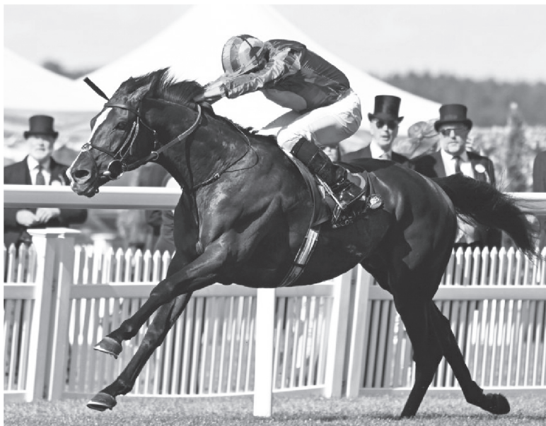
AUGUSTE RODIN (Brown 2020 16.0½ hh (1.63 m) Deep Impact - Rhododendron (Galileo)

Dual Derby hero and winner of six Group 1s! A Group 1 winner at 2, 3 & 4 years old! Futurity Stakes-Gr.1, Epsom Derby-Gr.1, Irish Derby-Gr.1, Irish Champion Stakes-Gr.1, Breeders' Cup Turf-Gr.1, Prince of Wales's Stakes-Gr.1. Defeated 21 Group 1 winners, with 45 Group 1 wins between them! "Auguste Rodin ran faster late on than any winner in the modern era, and that is quite something.