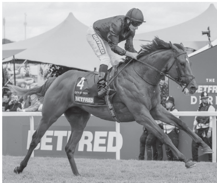
CITY OF TROY (Bay 2021 16.1hh (1.65 m) Justify - Together Forever (Galileo)

Dual Derby hero and winner of six Group 1s! A Group 1 winner at 2, 3 & 4 years old! Futurity Stakes-Gr.1, Epsom Derby-Gr.1, Irish Derby-Gr.1, Irish Champion Stakes-Gr.1, Breeders' Cup Turf-Gr.1, Prince of Wales's Stakes-Gr.1. Defeated 21 Group 1 winners, with 45 Group 1 wins between them! "Auguste Rodin ran faster late on than any winner in the modern era, and that is quite something.