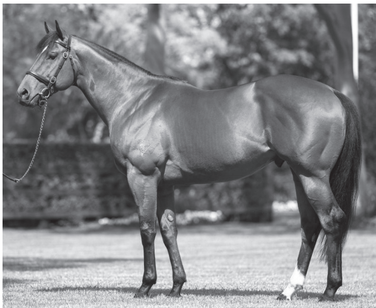
HOME AFFAIRS (Bay 2018 16.2 hh) I Am Invincible - Miss Interiors (Flying Spurr)

Top-Class Gr.2-Winning 2YO & Brilliant Dual Gr.1-Winning 3YO Sprinter. Sire of the highest priced yearling ever at Magic Millions Gold Coast Sale at $3.2 million! Won the Gr.2 Silver Slipper at Rosehill "broke his maiden with a polished performance in the Silver Slipper Stakes" ANZ, 26th Feb 2021.