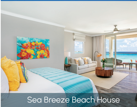
Sea Breeze Beach House

At Ocean Hotels Barbados, we believe that true beauty lies in embracing genuine cultural experiences. With an unwavering commitment to warm hospitality and a clear focus on sustainability, our highly-skilled team is devoted to surpassing your expectations with exceptional service. We are dedicated to redefining the standards of excellence for everyone who visits our hotels.