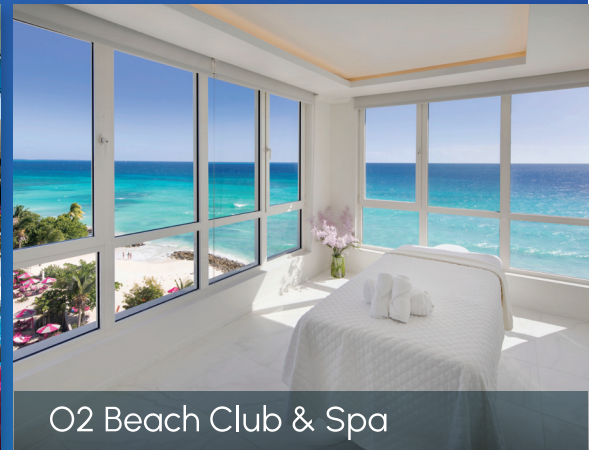
O2 Beach Club & Spa

Sea Breeze Beach House is a luxurious, all-inclusive, resort that offers an idyllic Caribbean escape for travelers seeking relaxation, comfort, and stunning ocean views.